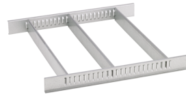
81484002 Drawer dividers