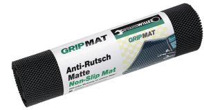
89010003 Non-slip mat GRIPMAT